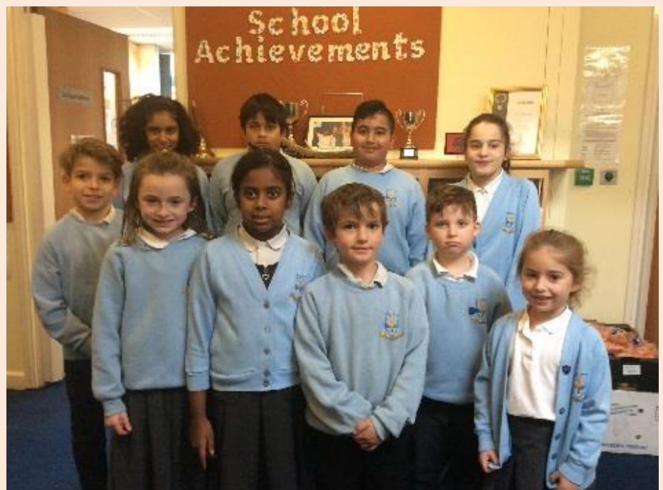
Hartsbourne School Council, Y2 – Y6

This clear wheel, displayed in all classrooms at Hartshorne Primary School, outlines Kelso' Choices – a powerful strategy that is strengthening emotional resilience and independence in all the pupils within the school and enabling them to deal with any minor issues that occur in any busy learning community.